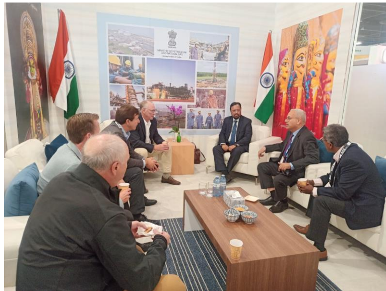
FIPI promoted India Energy Week 2024 during the WPC at Calgary

The closing ceremony of the WPC 2023 was held on 21 st September 2023. Many important conversations happened in Calgary to help define realistic, workable paths to a net zero future.