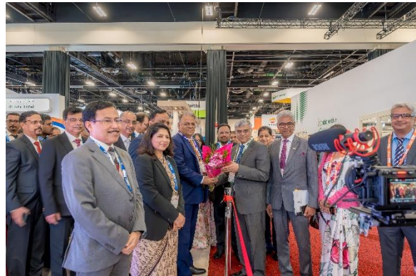
Inauguration of India Pavilion by Shri Pankaj Jain, Secretary, Ministry of Petroleum & Natural Gas during 24 th World Petroleum Congress at Calgary, Canada